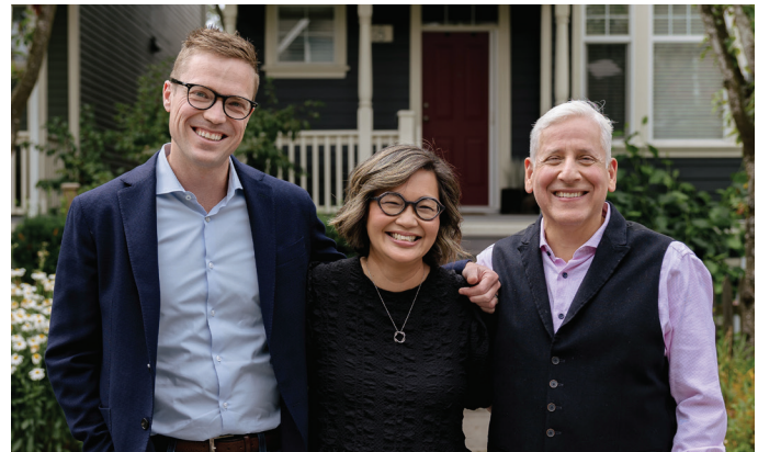
Bayswater Group — TD Wealth Private Investment Advice